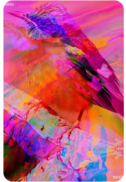
DISCLOSURE AR UNIBIRDS ARTWORK: MONJITO RAYADO THE UNIVERSE OF COLOMBIAN BIRDS TECHNIQUE: PRINTED - MIXED DIGITAL MEDIA + AR 04/11 PART OF THE DISCLOSURE SERIES BY MA+CH

CZ. 08/21-22. As part of the Plan for the Promotion of Colombia Abroad, the Colombian Embassy in Austria organized, with the Ibérica Festival, a tour in the Czech Republic of the UNIBIRDS art installation. The exhibition has had several allies such as the mayors of the different cities and the cultural centers Šumperk Dům kultury, the Lužánky park, HaDivadlo Spanish Club, Europe Direct and, Infocentrum, these last three in Pardubice.