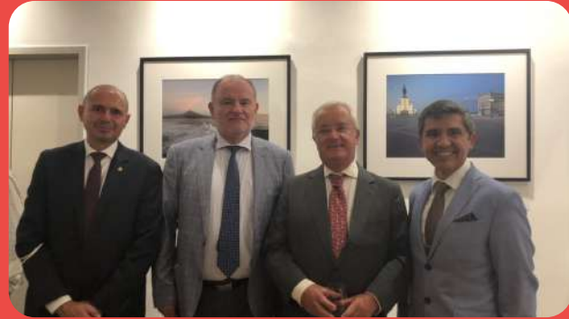
Ambassadors of Costa Rica, Colombia, Spain and Paraguay