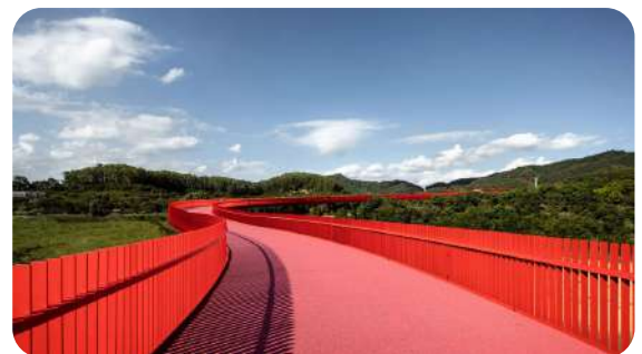
Hongqiao Forest and Sports Park Shenzhen, CN Park + Forest | 600 Ha Phase I - Built 2020 Phase II - Under construction Team: Lola Landscape | L+CC