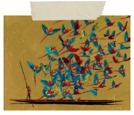
Photo: Obra, Araracuara, 2009, acrílico sobre madera, 45.5*41 cm, serie Oro, Pedro Ruiz