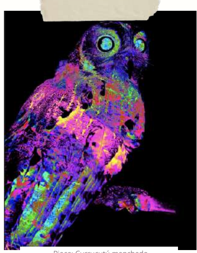
Piece: Currucutú manchado Técnica: Impreso - Medios digitales mixtos + RA Parte de la serie Disclosure RA Unibirds de Studio MA+CH