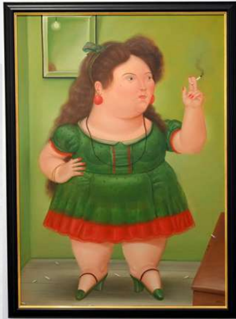
Rauchende Frau - Fernando Botero

The Leopold Museum presents for the first time in Austria an exquisite selection of works from the Würth Collection, one of the largest private collections in Europe. Of the more than 20,000 works in the collection, 200 were selected, including several works by the renowned Colombian artist Fernando Botero . The exhibition brings together works ranging from classical modernism to contemporary art, allowing the viewer to take a unique journey through more than 200 years of art history.