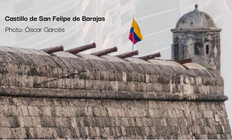
Castillo de San Felipe de Barajas

Holešovice Market. Hall 13, Stand 16. Prague (CZ)