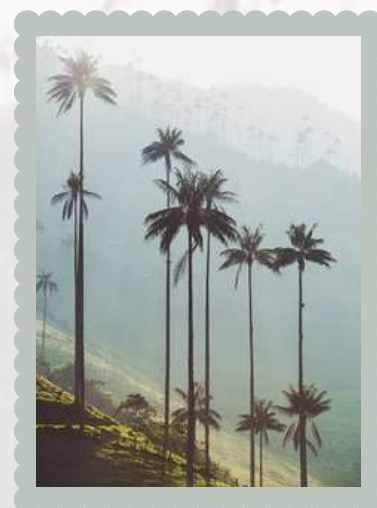
Valle de Cocora, Quindío.

Radio Kulturhaus, Großer Sendesaal, Argentinierstraße 30A, Vienna