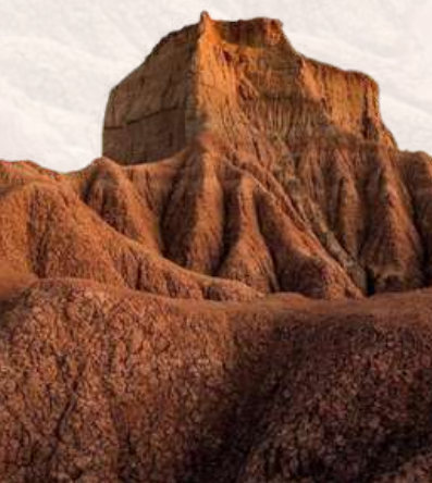
Desierto de la Tatacoa, Huila.