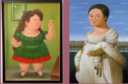
Rauchende Frau y Mademoiselle Rivière - Fernando Botero

The Leopold Museum presents for the first time an exquisite selection of works from the Würth Collection, one of the largest private collections in Europe. Of the more than 20,000 works in the collection, several works by the renowned Colombian artist Fernando Botero have been selected.