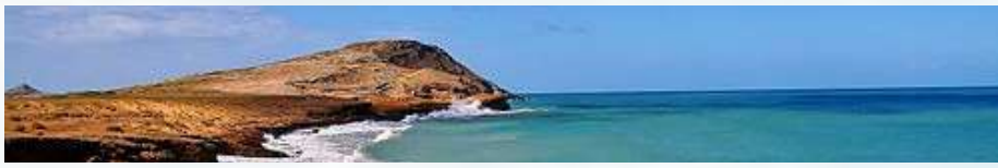
Cabo de la Vela, La Guajira.