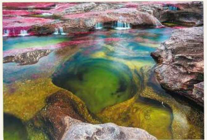
Caño Cristales, Meta.

As June is the month of biodiversity, we want to exalt the beauty of Colombia's fascinating landscapes in the pages of this edition and celebrate the fact that we are one of the most biodiverse countries in the world. In this newsletter you will find a variety of events in Austria and in our concurrences related to Colombian culture, ranging from rock art in the Serranía de la Lindosa to performances of classical music with a Colombian touch. We invite you to participate!