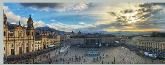
Plaza de Bolívar, Bogotá.